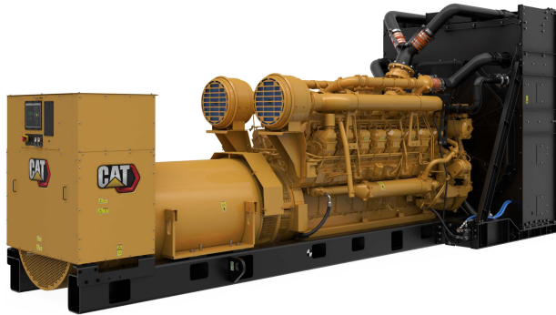
Image shown may not reflect actual configuration