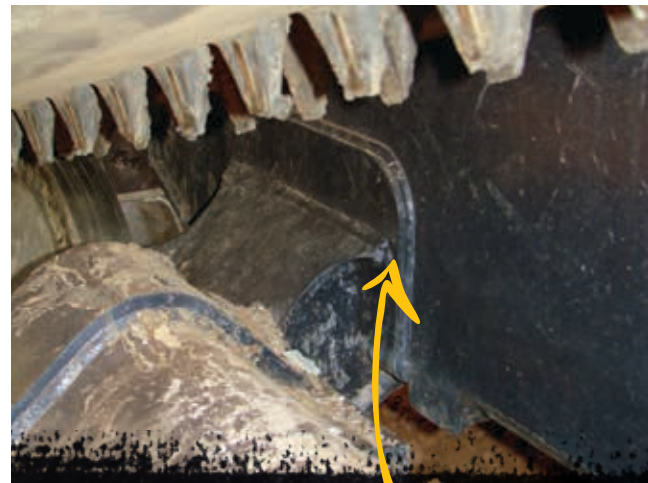
Competitor No Suspension, Rigidly Mounted Undercarriage