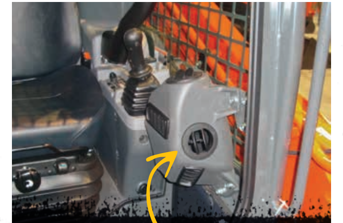
Competitor Vents Only On One Side of Cab