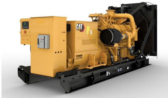
Image shown might not reflect actual configuration.