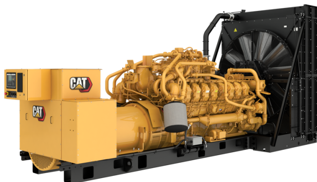
Image shown may not reflect actual configuration